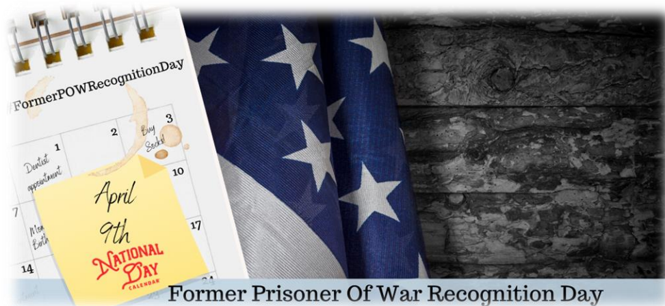
Former Prisoner Of War Recognition Day

PS. If you have not received your COVID vaccine, you have now run out of excuses. The Johnson and Johnson "one shot and done" vaccine is available, and the State just indicated that everyone over the age of 16 can receive the vaccine at one of the several vaccination locations available locally. GET VACCINATED TODAY TO PROTECT YOURSELF, YOUR FAMILY AND YOUR FRIENDS!!