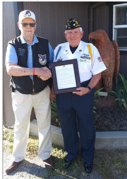
President, FOE Post Falls Aerie 3682