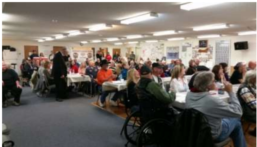
View of the Audience.