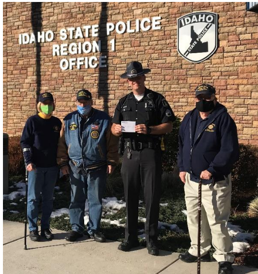
Idaho State Police