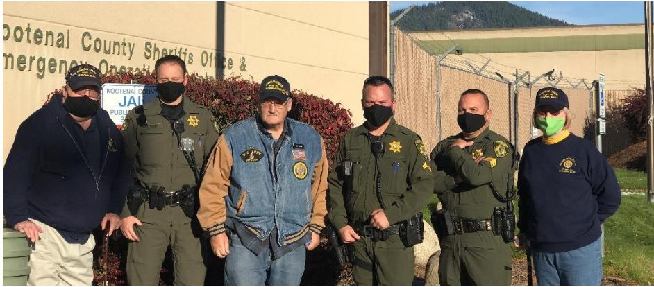
Kootenai County Sheriff