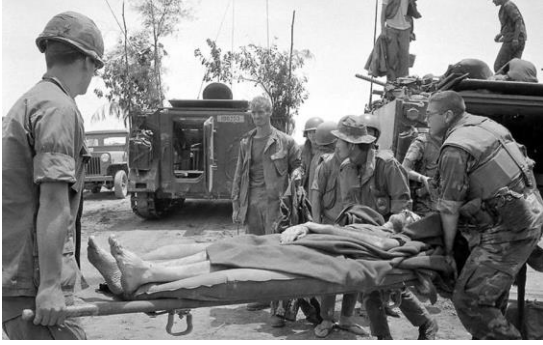
A wounded airman shot down over South Vietnam during the 1972 Easter Offensive is carried to an armored personnel carrier for evacuation.

Meanwhile, the processing, testing and analysis of bogus remains eats up resources, he said.