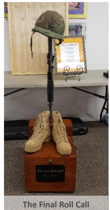
The Final Roll Call