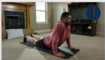
Exercises for a Healthy Back Back 5:38