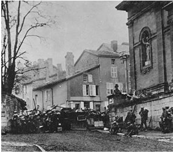
Soldiers of the 353rd Infantry near a church at Stenay, Meuse in France, wait for the end of hostilities. This photo was taken at 10:58 a.m., on November 11, 1918, two minutes before the armistice ending World War I went into effect

World War I – known at the time as “The Great War” - officially ended when the Treaty of Versailles was signed on June 28, 1919, in the Palace of Versailles outside the town of Versailles, France. However, fighting ceased seven months earlier when an armistice, or temporary cessation of hostilities, between the Allied nations and Germany went into effect on the eleventh hour of the eleventh day of the eleventh month. For that reason, November 11, 1918, is generally regarded as the end of “the war to end all wars.”