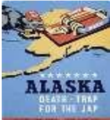
US military propaganda poster from 1942/43 for Thirteenth Naval District

Aug 15 1943 – WW2: Kiska Island, Aleutians - An invasion force of 34,426 Canadian and American troops landed on Kiska to find it abandoned. Under the cover of fog, the Japanese had successfully removed their troops on 28 July. Allied casualties nevertheless numbered 313 as the result of friendly fire, booby traps, disease, or frostbite. As with Attu, Kiska offered an extremely hostile environment.