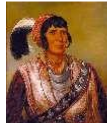
Osceola, Seminole leader

Aug 14 1842 – Indian Wars: Second Seminole War ends, with the Seminoles forced from Florida to Oklahoma. Casualties and losses: US 1,600 military, civilians UNK – Seminoles UNK