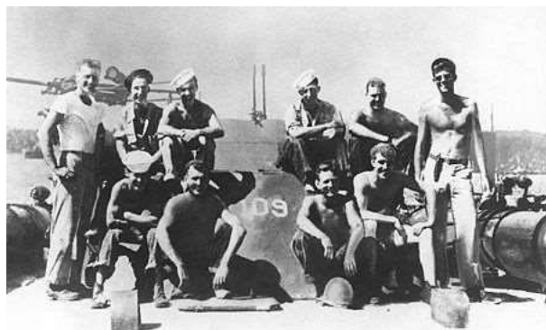
LTJG Kennedy (standing at right) on PT-109 in 1943

Aug 02 1943 – WW2: Motor Torpedo Boat PT-109 is rammed by the Japanese destroyer Amagiri and sinks. Lt. John F. Kennedy, future U.S. President, saves all but two of his crew.