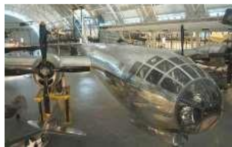
Little Boy Atomic Bomb and her deliverer Enola Gay today at the Steven F. Udvar-Hazy Center

Aug 06 1945 – WWII: USS Bullhead (SS-332) missing. Most likely sunk by Japanese Army aircraft (73rd Chutai) off Bali in the Java Sea. 84 killed.