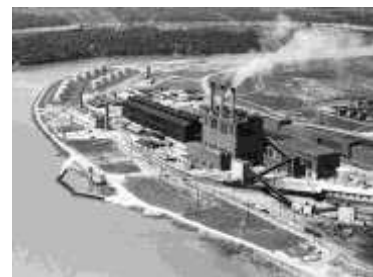
Oak Ridge K-25 plant, Hanford B Reactor, and S-50 Plant

Aug 13 1944 – WW2: USS Flier (SS-250) sunk by a Japanese mine south of Palawan in Balabac Strait. 78 killed, 8 survived and were rescued.